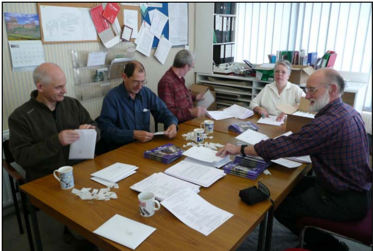
Preparing the 2007 Annual Report for posting.