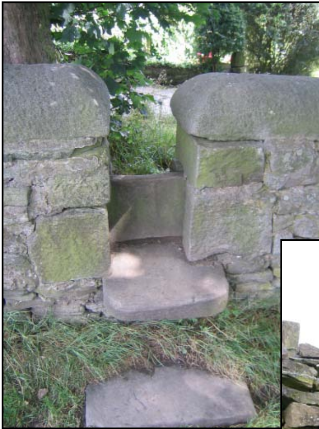
Two styles of stile one friendly one not so friendly

Once again, the Society is mindful that a lot of unsung work goes on in the field by our inspectors in the county: dealing with day-to-day problems and walking the network of paths to find and report problems; checking their resolution; and responding to requests for opinions on proposed path alterations. Inspectors come and go, but new ones are needed especially now for parts of High Peak, Derbyshire Dales and all the eastern and southern areas. Can you adopt a parish or three if you walk in Derbyshire? Contact Hilda Bowler please.