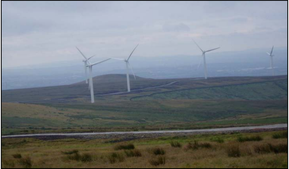
View of Knowl Hill, Rochdale obscured by giant turbines