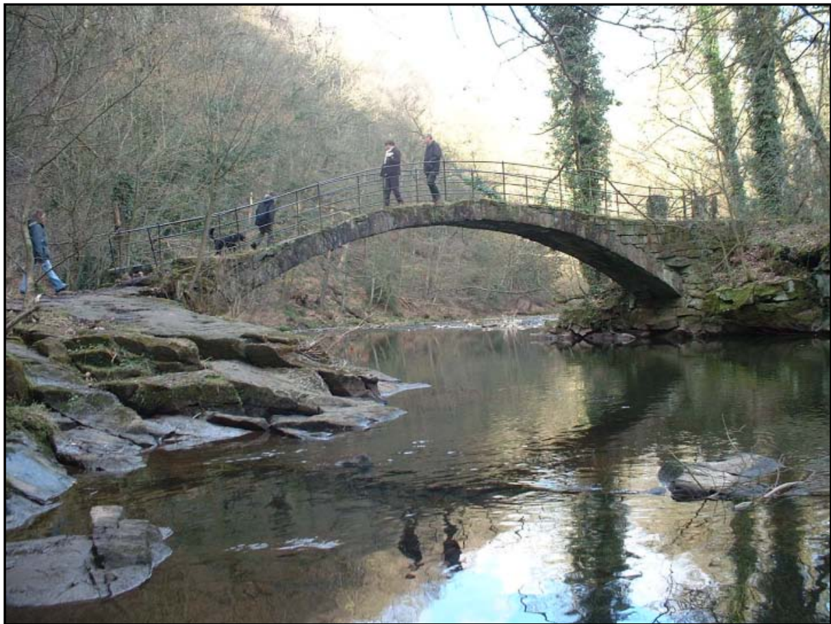
Roman Bridge - Marple