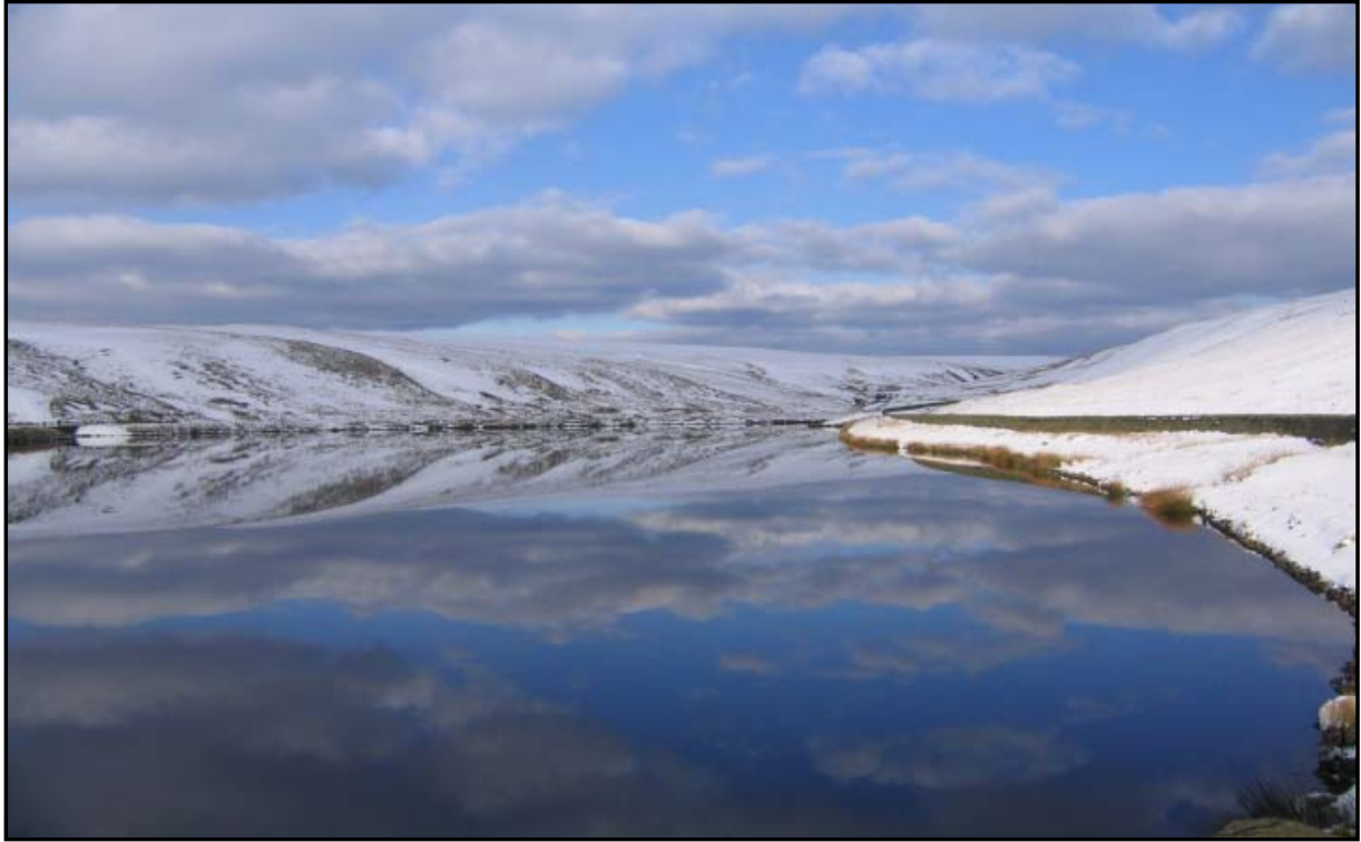
Readycorn Dean Reservoir Winter and Summer