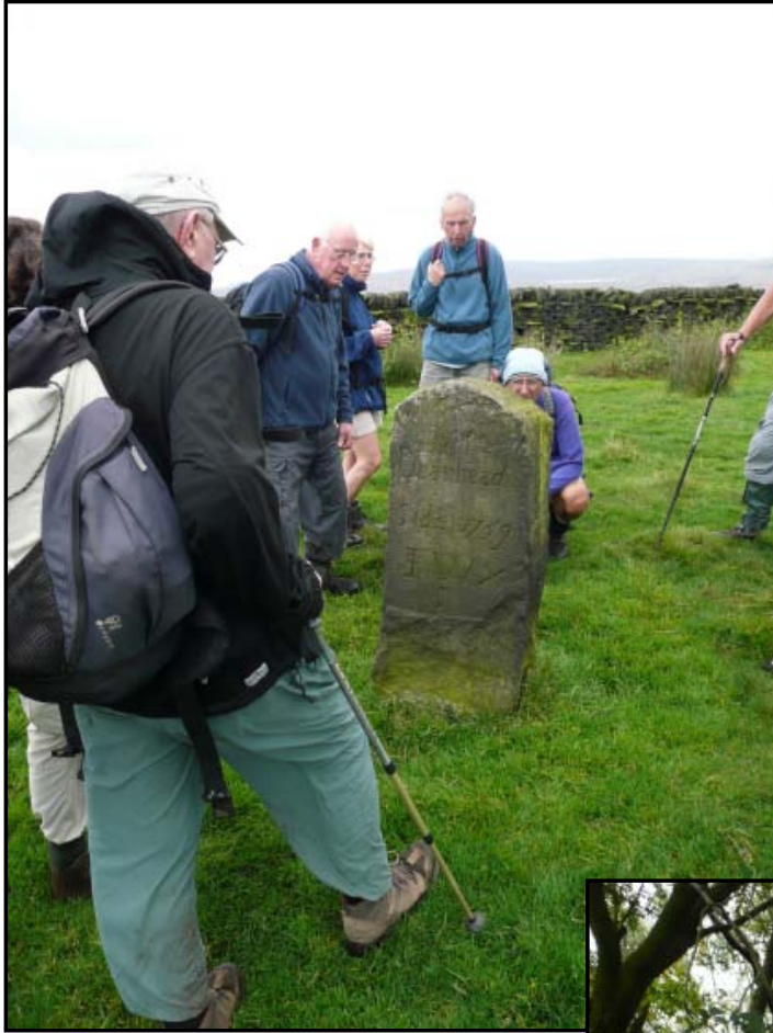
Photos from walks led by PNFS during the South Pennines Walk and Ride Festival