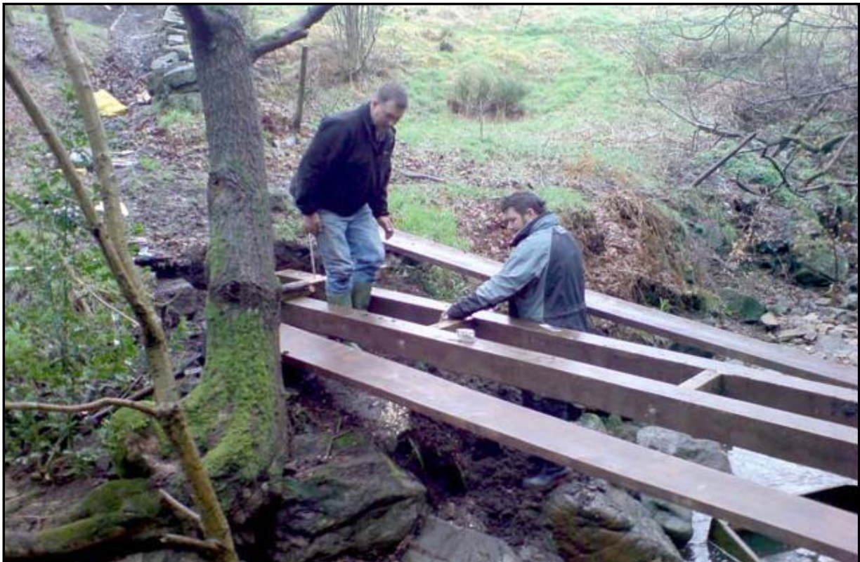
Hey Wood Bridge under construction

In line with our policy of promoting the areas which are some distance from Taylor House, we are currently looking at proposals in the County of Lancashire, Oldham, Kirklees, and Wakefield.