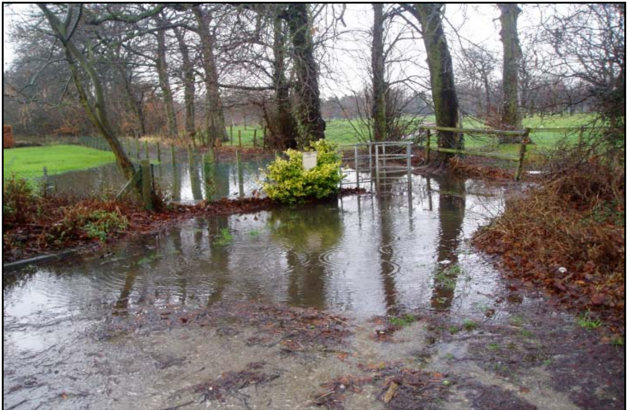
Culceth 75 a pond of the past resolved by PNFS action